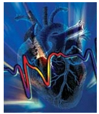
Heart Disease: Cholesterol molecules slip into the lining of coronary arteries and are engulfed by cells called macrophages. Eventually, a plaque forms. The stronger the inflammatory reaction, the more likely the plaque will burst, causing a heart attack or stroke